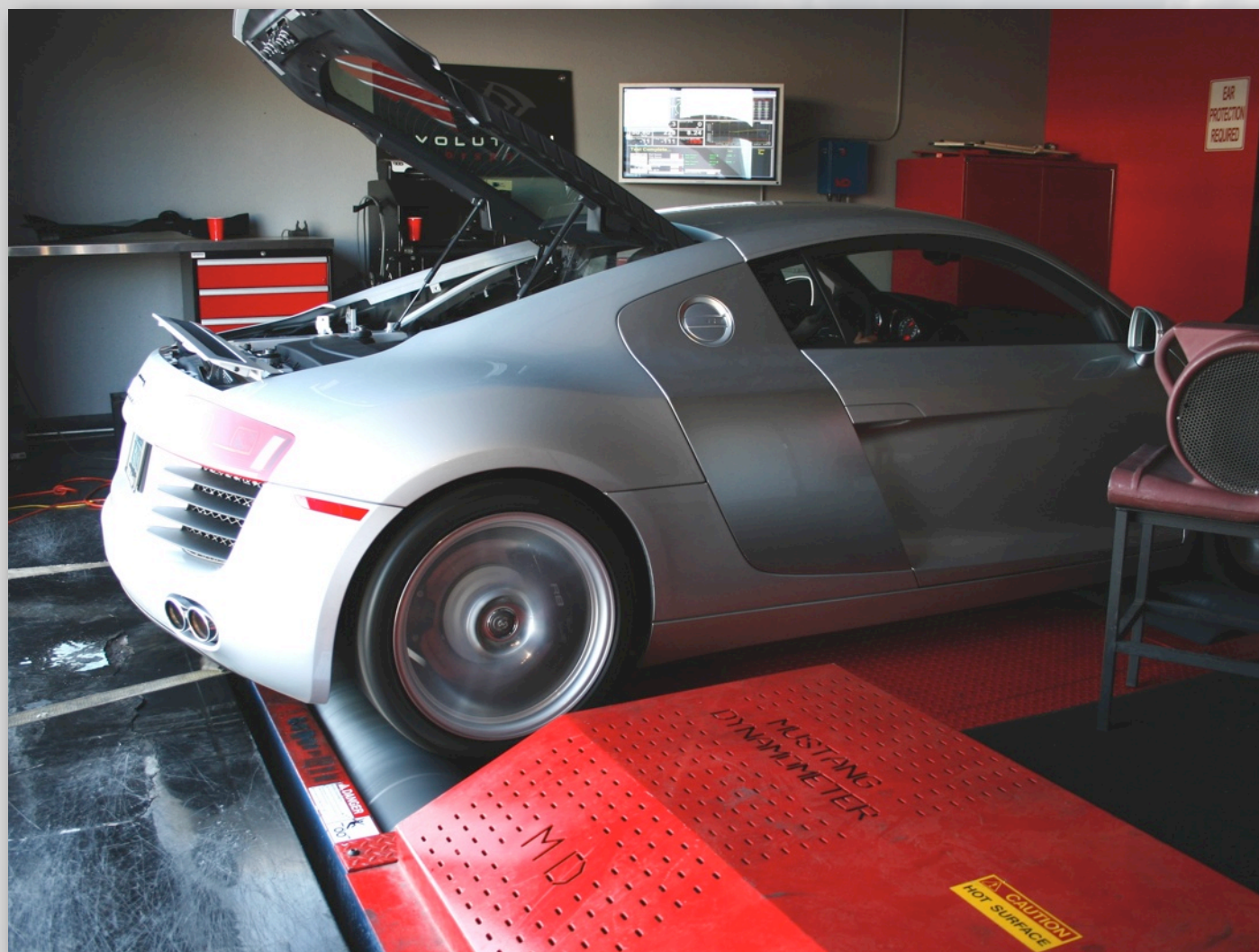
Audi R8 during Intelligent Tuning