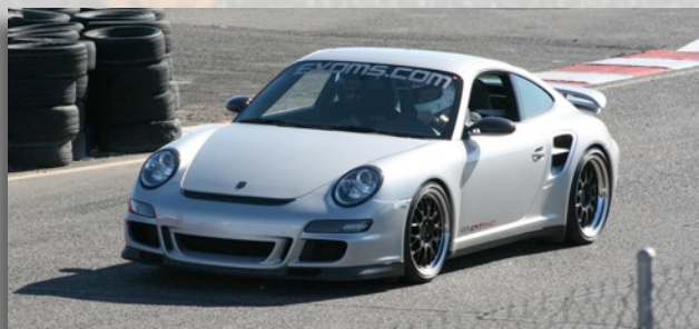
EVOMS Porsche 997 with EVT700 Performance System during track testing at Firebird Raceway Phoenix Arizona

SP (Sport Pedal™): All E-Gas (drive by wire) cars from model year 2000 and newer have an electronic throttle valve, which is controlled by the ECU. The EVOMSit Sport Pedal™ (SP) feature changes the ratio of accelerator pedal movement versus opening of the throttle valve increasing throttle response. By modifying these maps in the ECU calibration, throttle response is drastically improved and the "throttle delay" is virtually eliminated.