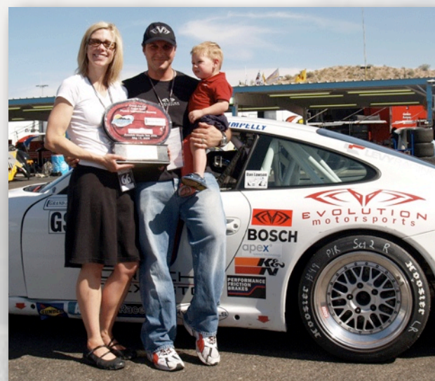
Family Zuccone and EVOMS, Winners at Phoenix International Raceway Grand Am/Koni Challenge

EVOMS Breaking Records 9.67 sec @ 149.86 mph! Englishtown, New Jersey, USA!