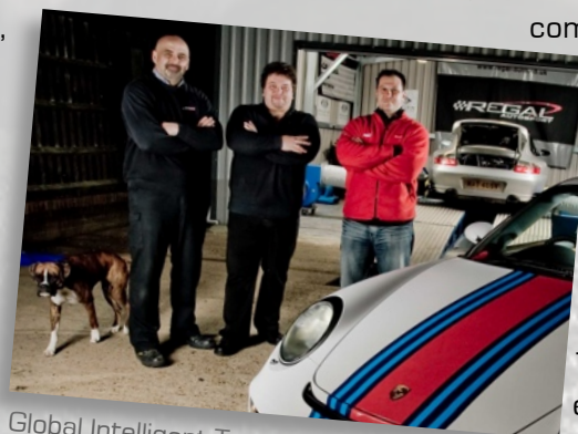
Global Intelligent Tuners and "Roxy" on location in the UK

mechanical and meticulous minds are responsible for deciphering and understanding the "brain" of the cars, translating the information and making the necessary changes to allow all of the engine systems and software calibrations to work together in perfect synchronicity.