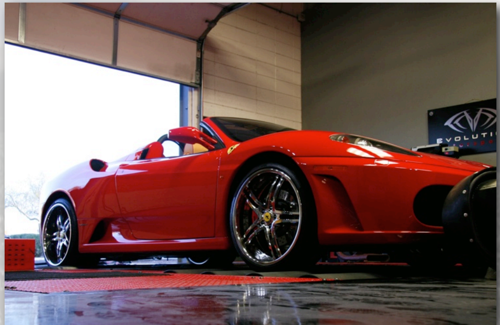
Ferrari F430 Spyder during Intelligent Tuning

EVOMSi it performance software clearly represents the apex of technology where pure adrenaline is fused with ULTIMATE PERFORMANCE!