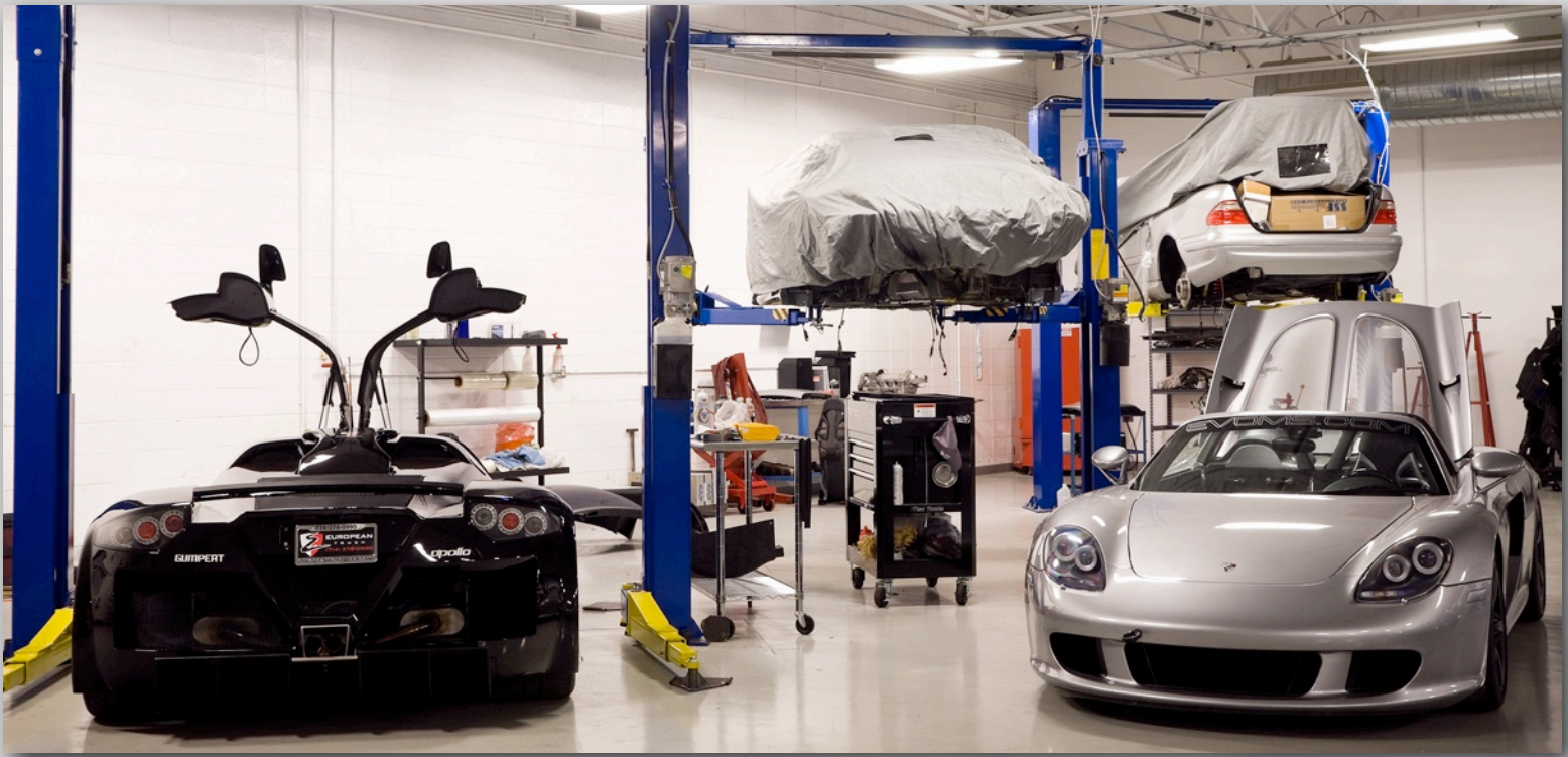
The Evolution MotorSports Performance Facility , Tempe, Arizona - USA.