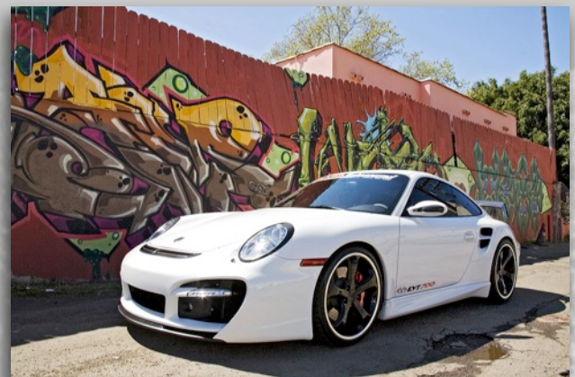
EVT700 997 With Techart GT Street