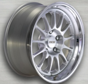
FIKSE Profil 13