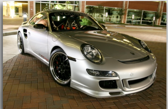
EVOMS EVT700 997 With GT3 Nose

We offer a wide variety of carbon fiber body enhancements as well as complete aerodynamic upgrades using the finest components available. EVOMS is a distributor for TechArt aerodynamic components as well as only the finest aftermarket body components for street or race. Our paint and auto body facility is accustomed to working with OEM and aftermarket components which ensures the installation and final fit and finish is second to none. We are obsessed with perfection especially when it comes to this aspect of the upgrade process.