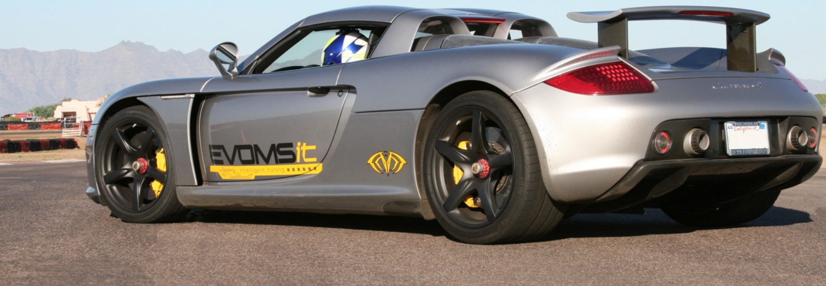
EVOMS / CGT for Intelligent Tuning at Firebird International Raceway, Phoenix, Arizona