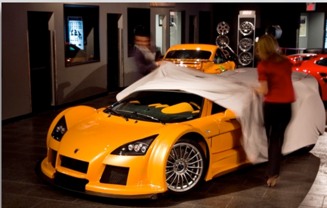
Unveiling the Gumpert Apollo to the USA.

Car dealerships are not familiar with high horsepower vehicles. They are not interested in preparing a car for a race weekend.