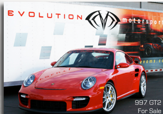
997 GT2 For Sale

Additionally, if vehicle transportation is required, EVOMS can transport vehicles coast to coast in our enclosed transporter and we work with the most reliable logistics companies to ensure safe and prompt delivery nationally and internationally. Inquire about these EVOMS exclusive concierge services which have been designed to take the headache out of the luxury performance vehicle experience.