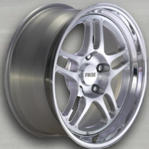
FIKSE Profil 5S