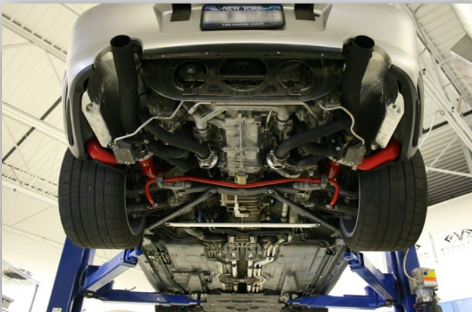
Porsche 996 Turbo GT1000 at EVOMS for Race Prep

perform any work including oil changes, clutch replacements, belts, brakes and ANY other mechanical service required. Before a trip, stop by and in less than an hour, a fine tune, topping off and getting ready was never quite so.. Fun!