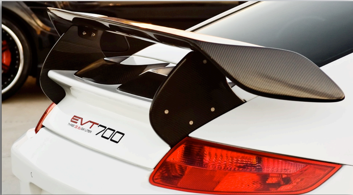
EVOMS 997 Carbon Fiber Tail