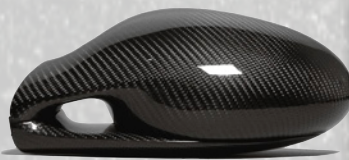
Carbon Fiber Mirrors

From mirror covers to air dam trim, Evolution MotorSports offers hundreds of options that allow the complete customization of a performance vehicle. Because we are enthusiasts and drive the same cars you do, we are aware of most unique components available for any vehicle.