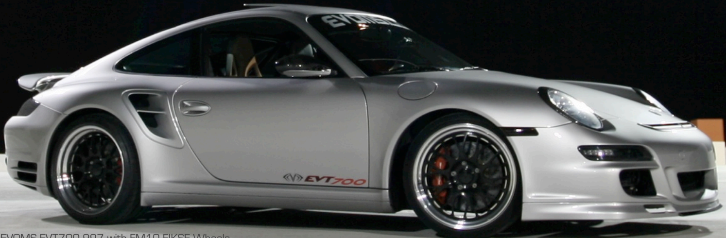
EVOMS EVT700 997 with FM10 FIKSE Wheels

Attention to engineering fundamentals also tends to produce the most visually pleasing wheels. This painstaking design effort results in a whole greater than the sum of its parts: a wheel that both appeals aesthetically and performs competitively at the highest level. An investment in FIKSE wheels is an investment in quality. Every step of the way, FIKSE USA specialists can help make the style, fitment, and finish choices that compliment your personal driving goals. Forged 1-Piece and Forged 3-Piece Wheels. Porsche Sizes 17", 18" & 19"