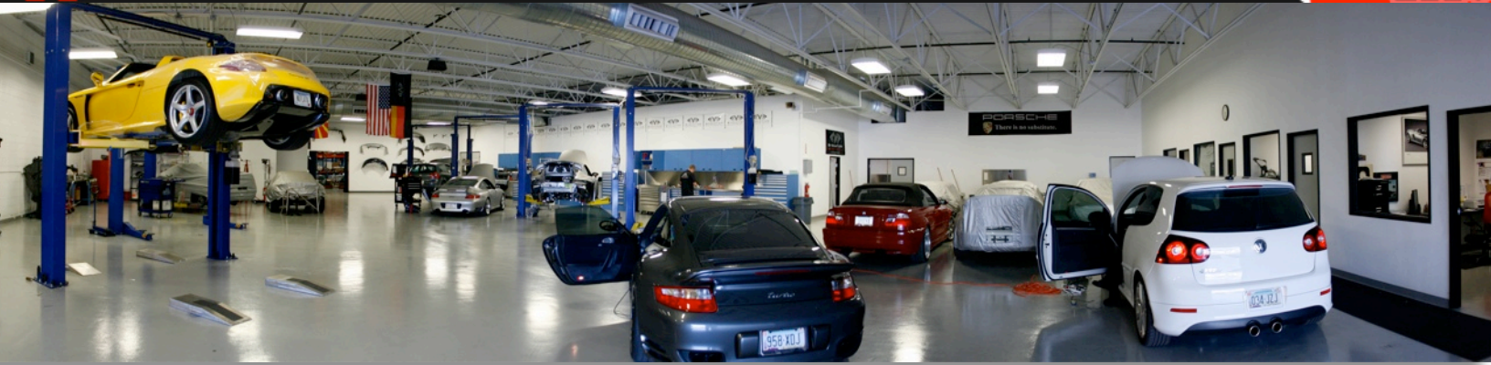
The Evolution MotorSports Facility. Tempe, Arizona - USA