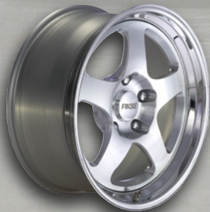
FIKSE Profil 5