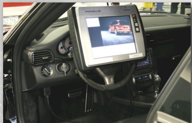
Porsche PIWIS Systems Tester

perform any work including oil changes, clutch replacements, belts, brakes and ANY other mechanical service required. Before a trip, stop by and in less than an hour, a fine tune, topping off and getting ready was never quite so.. Fun!