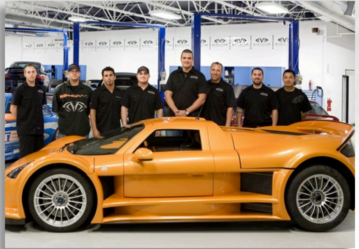
The EVOMS Team & The Gumpert Apollo!