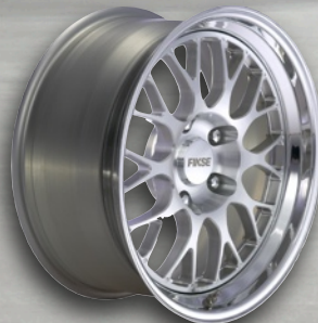
FIKSE Profil 10