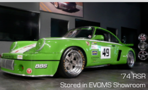
'74 RSR Stored in EVOMS Showroom

With EVOMS Vehicle Sales we bring buyers and sellers together. Evolution MotorSports can be the one phone call to make, to acquire a certain dream car, or to allow our professional marketing team sell a car to