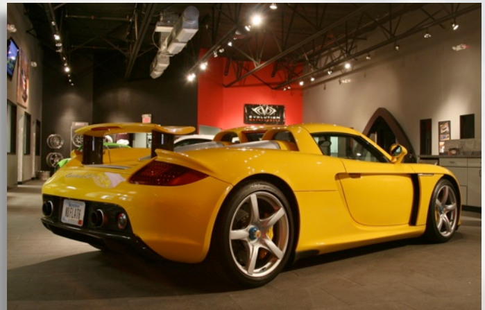
The EVOMS Showroom

Evolution MotorSports is unlike any tuner, race garage or performance shop... probably the United States. We offer real performance services not readily available in the valley of the sun. EVOMS is, in fact, a research and development center and we design and distribute