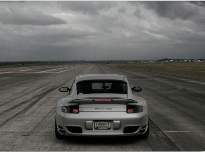
EVOMS EVT700 ready to launch at Texas Mile!